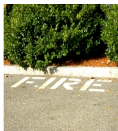
marking of fire circulation lanes