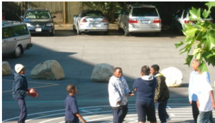
boulders provide separation between car parking & student play area