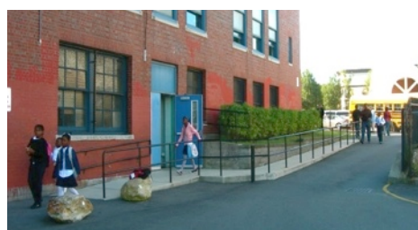
handicap ramp added during new construction for schoolyard