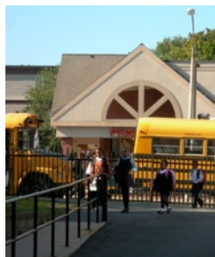
safe access to bus