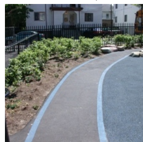
paint defines walking path