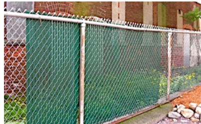
visual barrier - inexpensive privacy screen, slats added to an existing fence