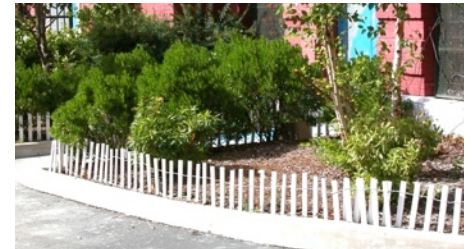
fence to protect plantings (installed by teachers)