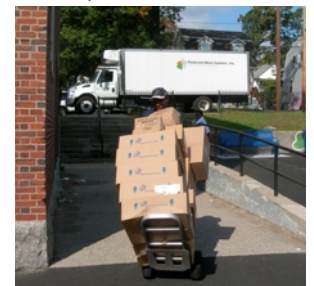
delivery access route