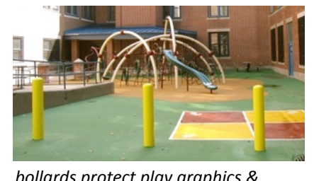
bollards protect play graphics & structures from vehicular traffic (deliveries pass by on wheel carts)