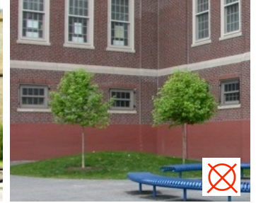
repetition of same species - lost opportunity