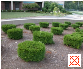
avoid mono crop plantings