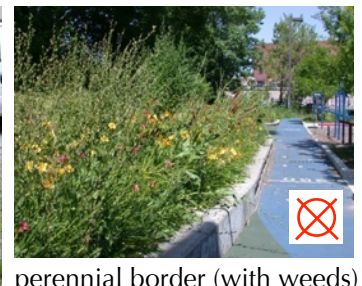
perennial border (with weeds) - not recommended, requires specialized maintenance