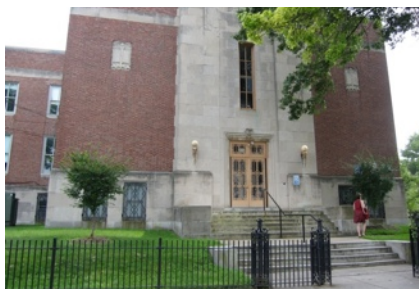
protected lawn at school entrance for beautification (in non-active play space)