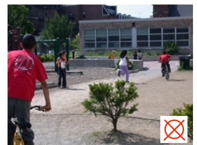
no lawn remains in active play space, high intensity use by school and neighborhood