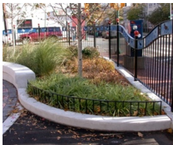
good protection of raised bed with low fence