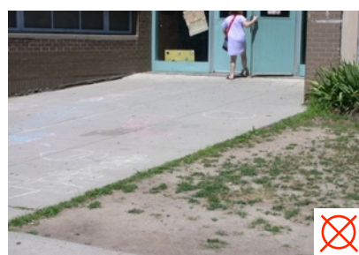
non-protected lawn at school entrance, compacted soil, walking short cut, heavy use