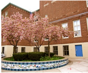
raised bed protects cluster of trees, shrubs & perennials