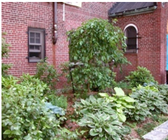
diversity of plantings