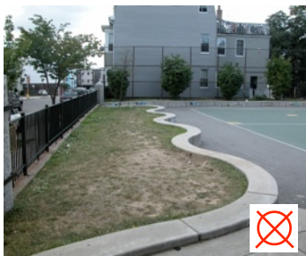
no plantings remain without protection (conflict of use)