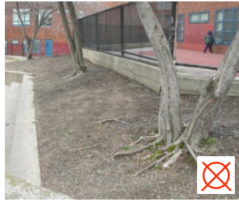
trees suffer from soil compaction and erosion