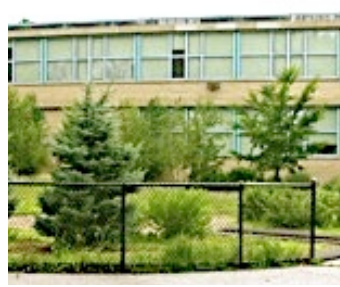
diversity of trees and shrubs adds educational value