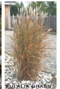
spring bloom winter color evergreen grasses - seasonal change - range of characteristic - habitat -